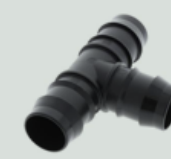
1" insert (barbed) tee for 1" poly tubing

When selecting either of these fittings, it is essential to identify the ID and/or OD of the tubing and verify that it is compatible with the fittings selected. Like the smaller 1/2" tubing, the larger diameter poly tubing will be easier to work with after it is uncoiled and laid out in direct sunlight for about 20 minutes. This will warm the tubing and make it more pliable and easier to force into fittings, and reduce the tendency to re-coil during installation.