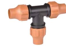
Universal Nut Lock™ Tee

FLOW RATE: Since the poly tubing is the main supply line for majority of non-commercial drip irrigation systems, it is very important to know how much water it can deliver without creating hydraulic problems like excessive water velocity or pressure. Remember that drip systems apply water at lower pressure and at lower flow rates (gallons per hour-GPH) than sprinkler systems (gallons per minute-GPM). Of course, the larger the inside diameter, the more water the tubing can deliver. The maximum flow rate for .700" OD and .710" OD poly tubing is approximately 220 gallons per hour. This means that the total