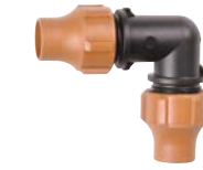
Universal Nut Lock™ Elbow