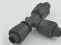
3/4" Spin-Loc tee for 3/4" poly tubing

Specialized compression fittings are available in many configurations (similar to 1/2" compression fittings) which fit over the outside of the tubing. Also available for 3/4" and 1" poly tubing are barbed insert fittings and adapters which are forced into the end of the tubing and are sometimes held in place with a hose clamp.